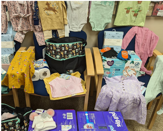
Pregnancy Resource Centers of Saginaw