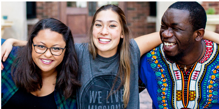
Chi Alpha Campus Ministry